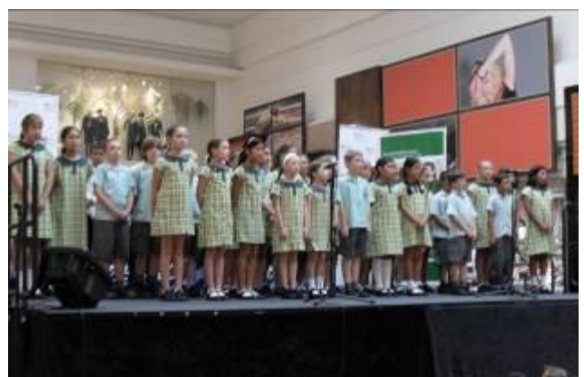
Westfield Miranda 2009 Performers